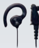
● Wired Earpiece