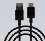
● Data Cable